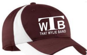
I. Colorblock Cap