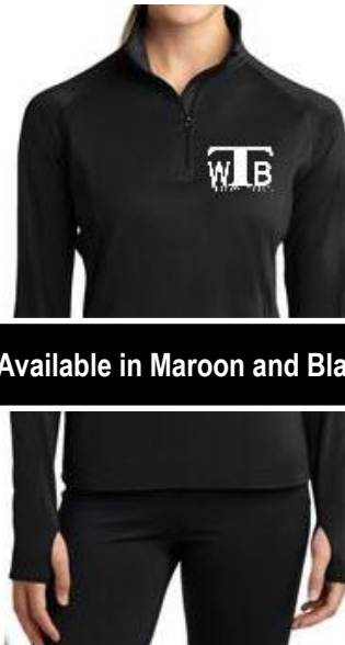
P. Women's 1/2 Zip Pullover ADULT SMALL – 4XL 90/10 poly-spandex