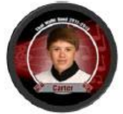
N. Photo Button