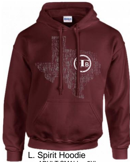
L. Spirit Hoodie ADULT SMALL – 5XL 50% cotton/50% polyester