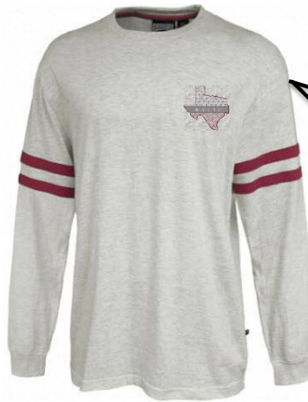
M. Women's Vintage Jersey ADULT SMALL – 4XL 100% cotton