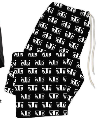
H. Lounge Pants ADULT SMALL – 3XL 60/40 poly-cotton jersey knit