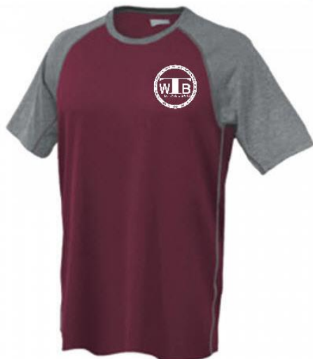
E. Men's Performance Shirt ADULT SMALL – 4XL 100% polyester