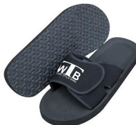
K. Slip-on Sandals with adjustable strap WOMENS SMALL – XL MENS MEDIUM – 2XL