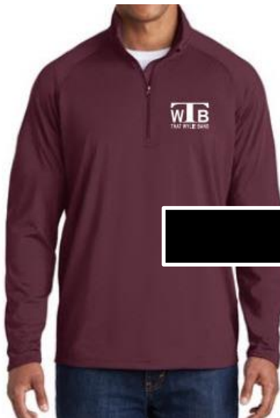
O. Men's 1/2 Zip Pullover ADULT SMALL – 4XL 90/10 poly-spandex