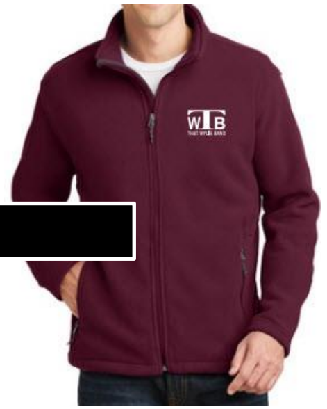
Q. Fleece Jacket ADULT SMALL – 5XL 100% polyester