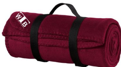
U. Stadium Blanket with handle 50" x 60" 100% polyester

Please submit completed order form and check made payable to Wylie Band Boosters to Mrs. Bahn's office OR email completed order form to Spirit@ThatWylieBand.net and pay online at http://thatwylieband.net/band-fees-payments/ and select SPIRIT WEAR