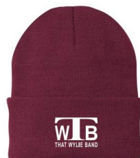
J. Knit Beanie Cap