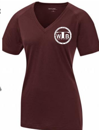
F. Women's Performance Shirt ADULT SMALL – 2XL 100% polyester