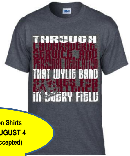
D. Section Shirt ADULT SMALL – 5XL 50% cotton/50% polyester Back designs will be created by each section

Show and Section Shirts order deadline: AUGUST 4 (no late orders accepted)