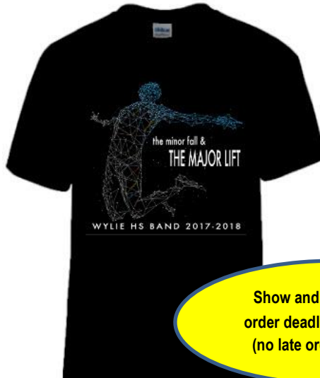
C. Show Shirt ADULT SMALL – 5XL 50% cotton/50% polyester

Show and Section Shirts order deadline: AUGUST 4 (no late orders accepted)