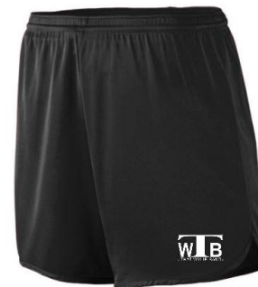
G. Running Shorts MEN'S and WOMEN'S FIT ADULT SMALL – 2XL - 100% polyester wicking knit - covered elastic waistband with inside drawcord - matching inner brief with leg elastic - 4" inseam