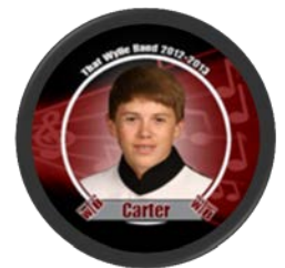
PHOTO BUTTONS Photo used is taken at registration

Additional Special Order Items will be offered throughout the season. Keep a look out for upcoming special orders!