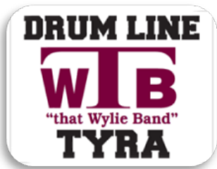
CUSTOM YARD SIGNS w/heavy duty stakes